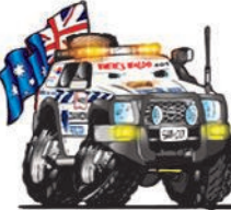
Where's Waldo Kar 405