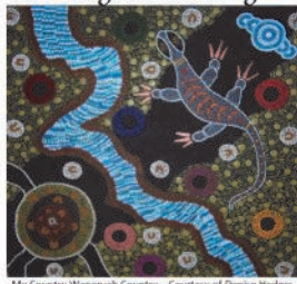
My Country Warranah Country Courtesy of Denise Hedges